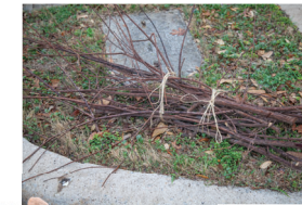
Examples of Bundled Brush

ALL BRUSH MUST BE TIED AND BUNDLED. Bundled brush cannot exceed four (4) by two (2) feet or weigh more than 40 pounds per bundle.