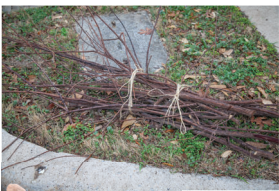
Examples of Bundled Brush

ALL BRUSH MUST BE TIED AND BUNDLED. Bundled brush cannot exceed four (4) by two (2) feet or weigh more than 40 pounds per bundle.